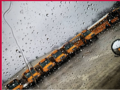
Submitted by Corinne, on Instagram