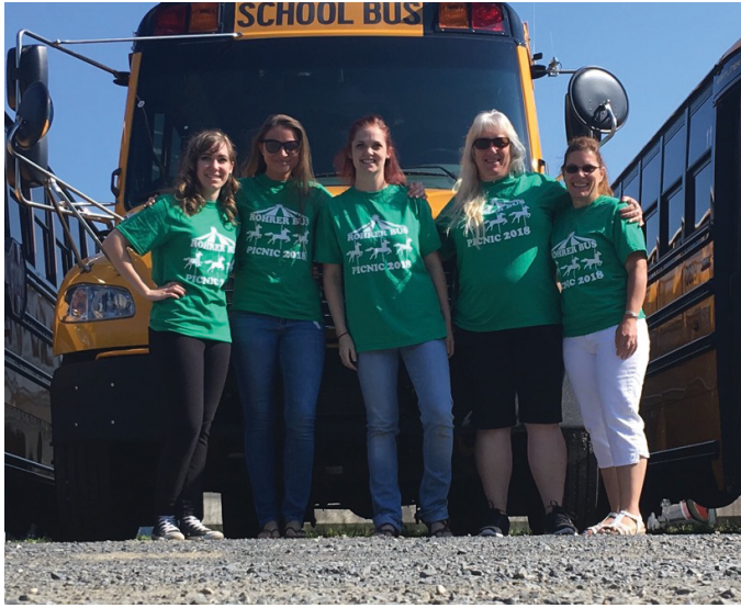
Our 2018 Knoebels Committee

Our last Knoebels Company Picnic was an incredibly fun day, wouldn't you say? All of the fun things we were able to do were thanks to our Knoebels Picnic Committee, a new group that came together to make the 2018 picnic the best picnic that Rohrer Bus ever had!